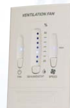
Lifestyle RNC Ventilation Control #99-BC01