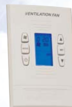
Lifestyle RNC Digital Control #99-DX01