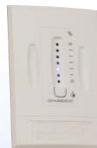
Lifestyle Dehumidistat #99-DH01